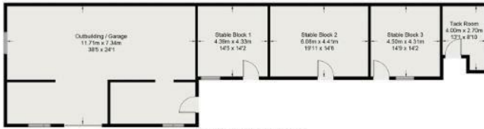
(Not Shown In Actual Location / Orientation)

Approximate Gross Internal Area = 217.3 sq m / 2339 sq ft Outbuildings = 162.5 sq m / 1749 sq ft (Including Garage) Total = 379.8 sq m / 4088 sq ft